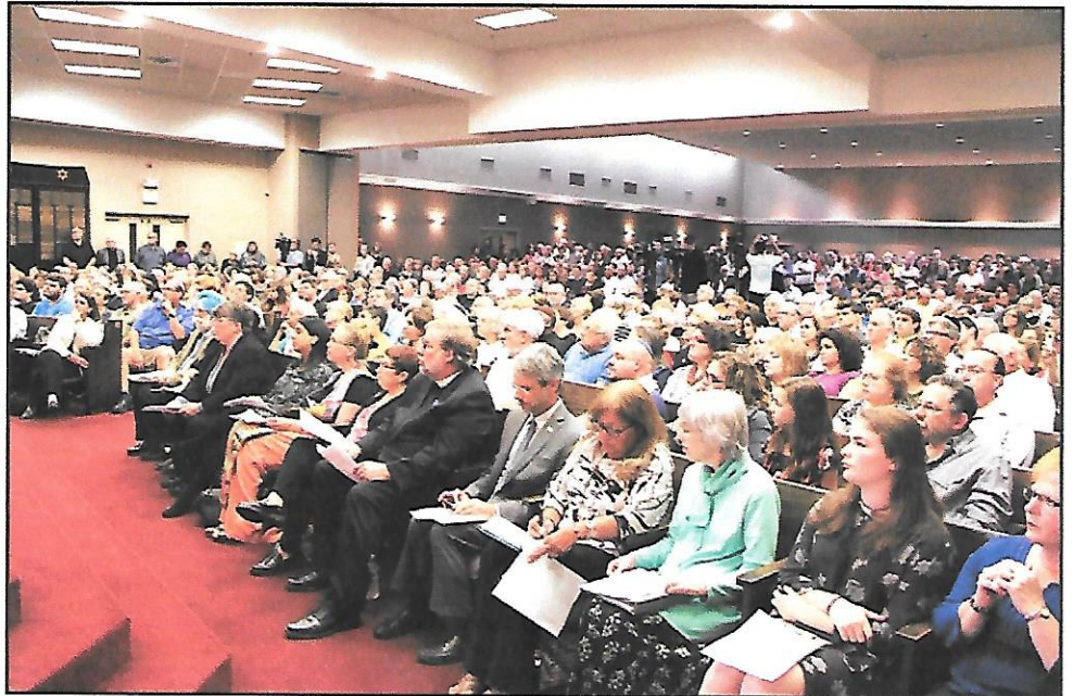
A massive gathering fills Congregation Shaarey Tefilla in solidarity with the synagogue.

This incident inspired Indiana Governor Eric Holcomb to call on lawmakers to pass (see Solidarity , page 13)