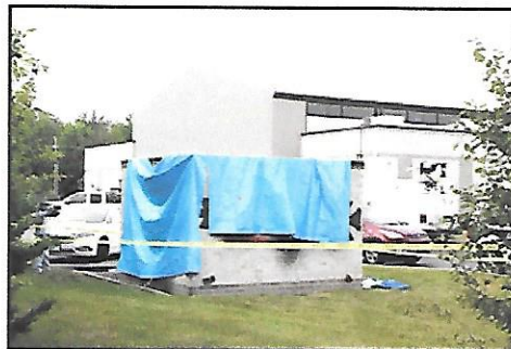
The structure behind the synagogue where the vandals painted the graffiti. Ed. note: Images of the uncovered symbols of hate are pervasive in the media. JP&O has deliberately elected not to further propagate those images.