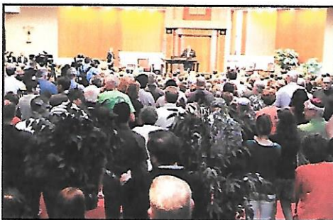
Standing room only as CST overflows with support.