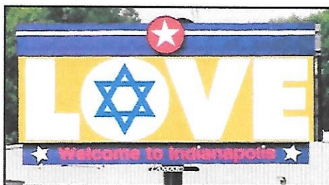
Billboards of support in Indiana displayed by Lamar Advertising.